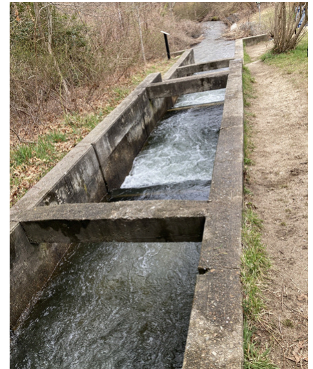
Herring run at the Mashpee Wampanoag Museum.

The migration of the herring upstream to the spawning grounds marks the beginning of spring here on Cape Cod. However, herring populations have declined significantly due human influences, such as dams that block their passage. To protect herring, which are vital to the ecosystem and human livelihoods, manmade herring runs have been constructed in several towns across the Cape to allow the herring to move upstream to spawn.